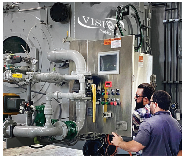
Standard offering includes integrated BMS/CCS/BCS system with precise control of boiler.

The complete line of VISION ProFlex burners combined with the proven line of Victory Energy industrial boilers and hot water generators deliver a vertically integrated package that is unmatched in the boiler industry. Count on Victory Energy for all your combustion requirements.