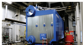
Steam Test Facility