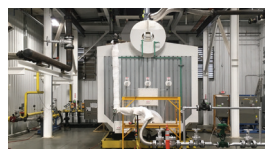
Steam Test Facility