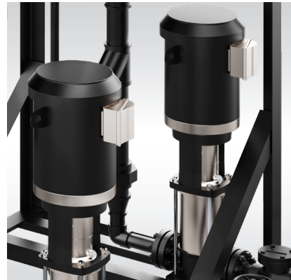
DUPLEX FEED PUMP ARRANGEMENT

INNOVATIVE DESIGN DELIVERS THE BEST PERFORMANCE METRICS IN FEEDWATER SYSTEM PRODUCT SOLUTIONS.