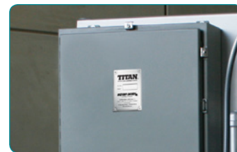
RELAY PANEL ASSEMBLY

The relay panel assembly provides the relay logic power for the water column and ALWCO probes.