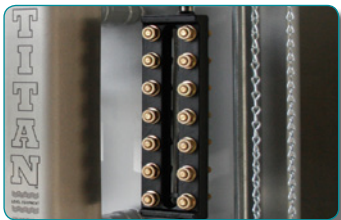
DIRECT-READING LEVEL GAUGE

The column has a direct-reading level gauge attached to it with level gauge valves.