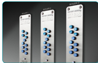
REMOTE WATER LEVEL INDICATOR

The TITAN remote water level indicator is designed to be mounted in the control room and is powered by the water column relay panel.