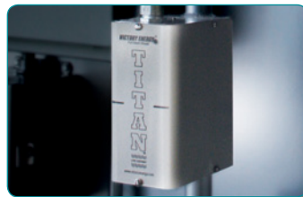
AUXILIARY LOW WATER CUT-OUT

The auxiliary low water cut-out assembly provides an extra measure of safety for the critical drum water level condition.